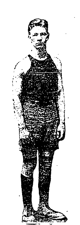
BENNETT HIBBARD. Now Britain's Star Quarterback.